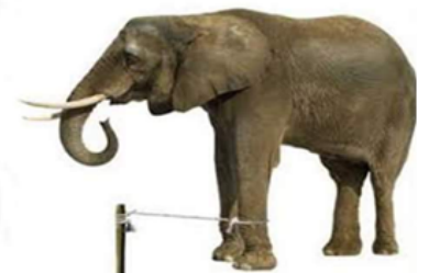
The Elephant Rope

Like the elephants, how many of us go through life hanging onto a belief that we cannot do something, simply because we failed at it once before? Failures are the stepping stones of our victory or glory. Besides, ‘the downhill’ moments enlighten us to understand the purpose of trials, suffering, testing and making sacrifices. We enter prayer with anger in our hearts, we come out in forgiveness; we go to the Lord in confusion, we come out in enlightenment; we go with our struggles, and we come away with strength to face them. We go with our doubts, and we come back with understanding. The sacrament of confession becomes a transfiguration for a good number of people who feel understood, comforted, and empowered to face the hard realities of life after celebrating the Sacrament. (Source acknowledged). The darkest moments of our life become in turn the most transfiguration moments!